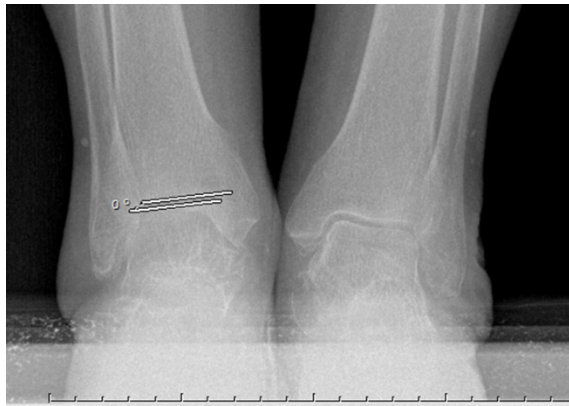
Figure 2 show measure talar tilt angle