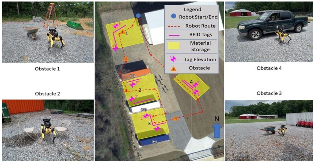
Figure 2. Experiment Layout

completion of the training run, the RFID payload was turned on and wirelessly connected to a laptop to record all read tags during each run. The RFID payload uses a terminal emulator (PuTTY) to wireless send the tag reads to a user interface in real-time. The robot traveled the predetermined route with the active payload, gathering RFID tag IDs. The experiment was run ten times under training run site conditions and ten more times with obstacles placed in the robot's path. Readings were logged and exported as *.txt files after the experiment, then loaded into an Excel spreadsheet for processing and noting any missed tags and probable in situ factors impacting readability.