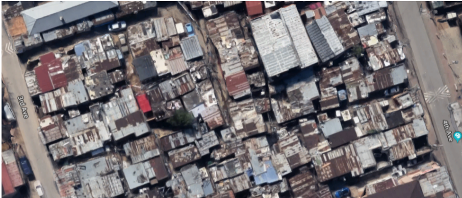
Illustration 2: Alexandra Township (Google map satellite view)