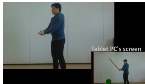
Fig.3 Tablet PC's screen

The play will terminate when a certain period of time has passed.