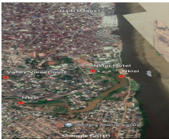
Figure 1: Map of Onitsha Showing Nkisi River

peak flow during the rainy seasons and discharges itself into river Niger. The climate of the study area is that of tropical rainforest with distinct wet and dry seasons. The wet season is characterized by a period a prolonged period of rainfall which extends from April to October, while the dry season is characterized by a period of dry hot weather. This season extends from November to March including the harmathan period. The mean annual rainfall ranges from 2000mm (inland) to over 4000mm at the coast. The vegetation comprises predominantly of red mangrove, ( Rhizophora racemosa ), plantain trees ( Musa sp. ), Oil palm trees ( Elaeis guinensis ) and Nipa palm ( Nypa fruticans ). This river is mostly used for domestic activities by the inhabitants of a settlement along the river. Construction sites and block industries also make use of the river water for construction purposes.