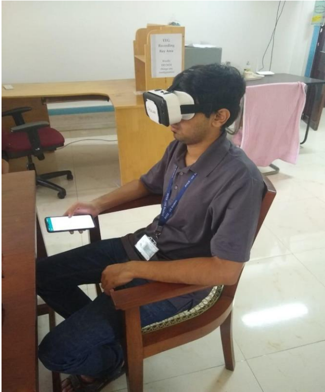
Figure 3: A participant undergoing the experiment.