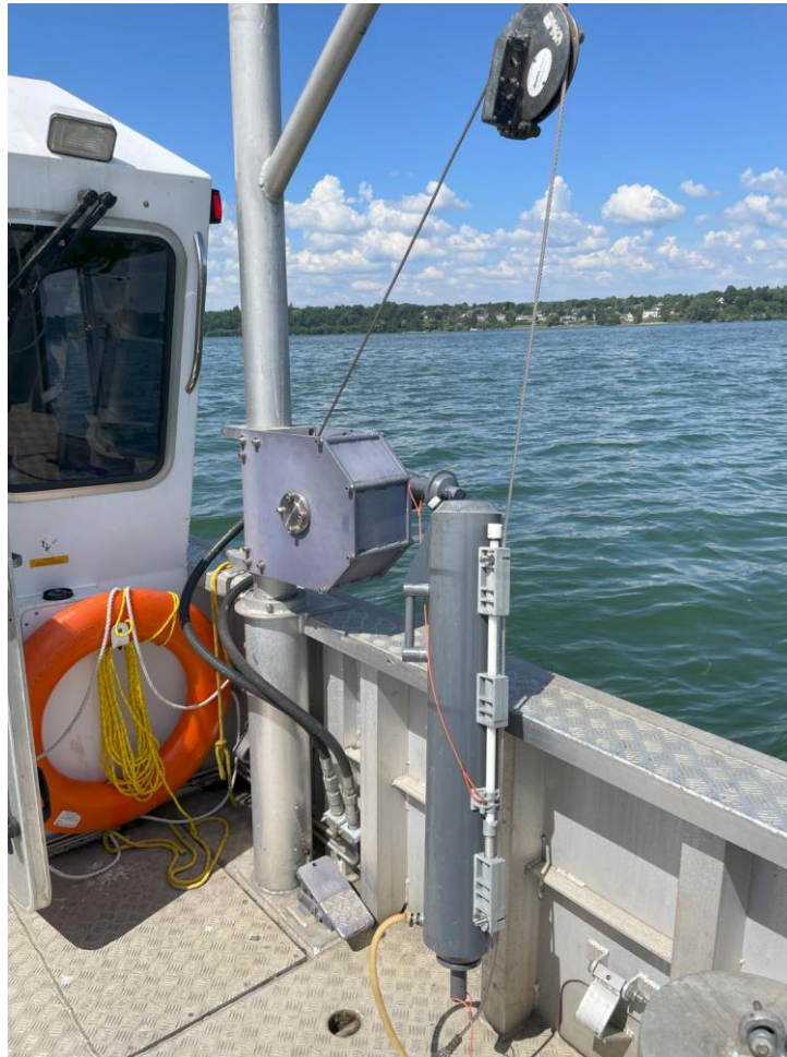
Fig. 1. Niskin bottle was applied to collect samples from different layers of Hamilton Harbor water

depth. A stainless steel Niskin bottle was utilized for sample collection, chosen specifically for its ability to collect water from distinct layers and accommodate very small-sized samples, aligning with the study's objectives (Bagaev et al., 2018). After collection, the water was placed into stainless steel containers with tightly sealed lids to eliminate the risk of external contamination. These samples were then transported to the laboratory and kept at a temperature of 4°C until they were further analyzed. Fig 1 illustrates the Niskin bottle that was used for the sampling process.